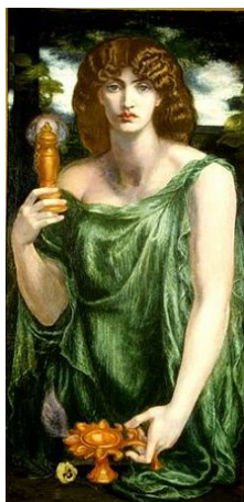
Mnemosyne Image by Dante Gabriel Rossetti

The Program Committee is busy formulating the 2015 Spring, Summer, and Fall Calendar of Events. Please submit suggestions you may have to one of the Program Committee Members.