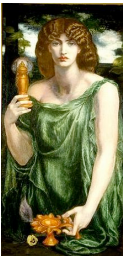
Mnemosyne Image by Dante Gabriel Rossetti